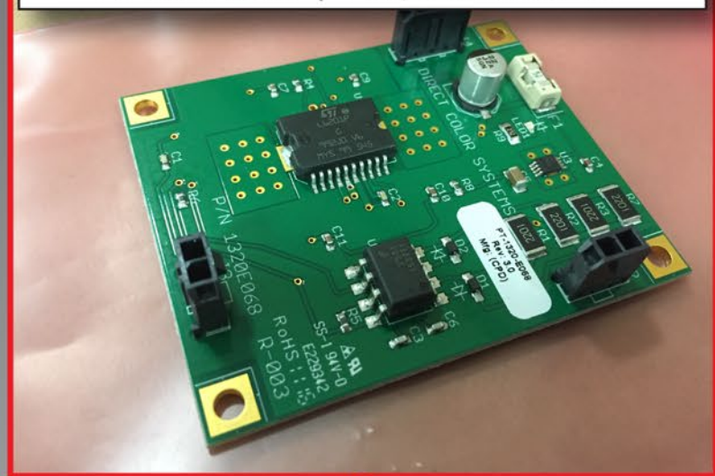
PT-1320-E068 | PCB, X-Axis Control