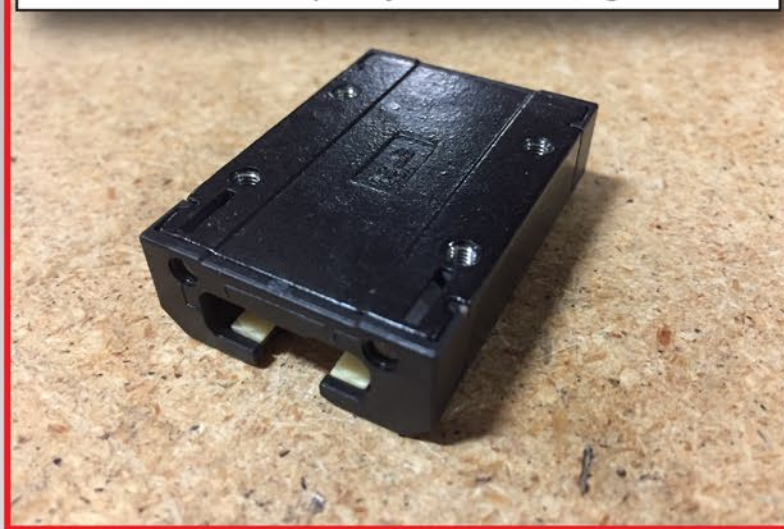
PT-1320-P159 | Adjustable Car, Igus Rail